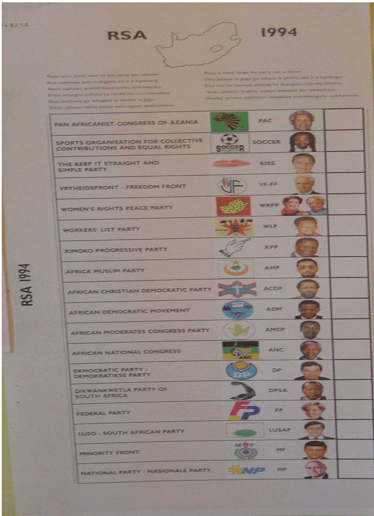
Apartheid - Anfang der Demokratie in Südafrika - Wahlunterlagen 1994